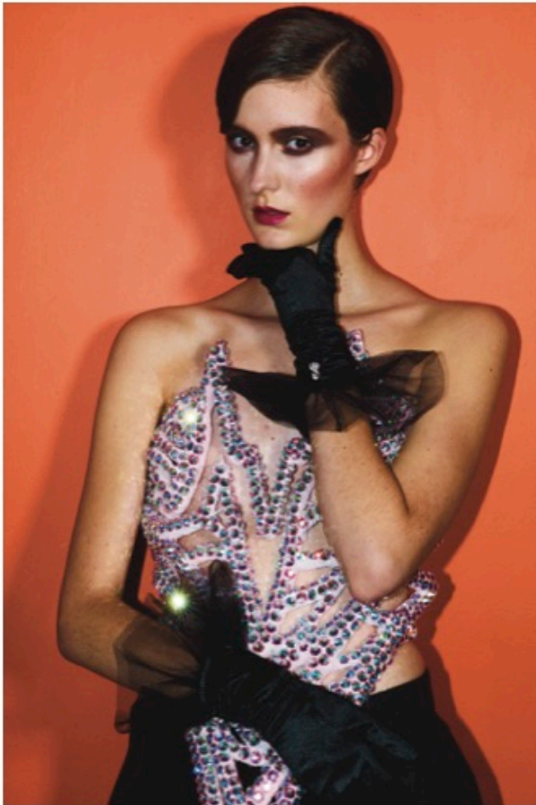
Blue corset JACK IRVING, gloves CORNELIA JAMES, trousers WILLIAM & SON Opposite postil arm pieces ZAEEM JAMAL, fur coat BEYOND RETRO, dress RED VALENTINO